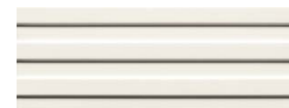
HIP HOP BIANCO 15 x 40 (G 81) 6" x 16" m