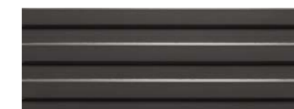
HIP HOP DARK 15 x 40 (G 81) 6" x 16" m