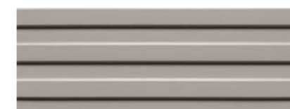
HIP HOP ALUMINIUM 15 x 40 (G 81) 6" x 16" m